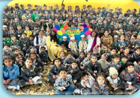
CHILDREN'S DAY CELEBRATION