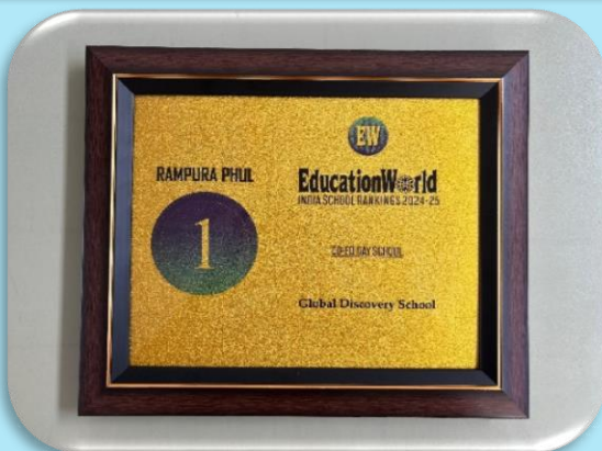
NO.1 SCHOOL RANKING